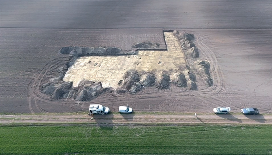
Aerial photograph of the excavation at Sükösd-Árpás-dűlő