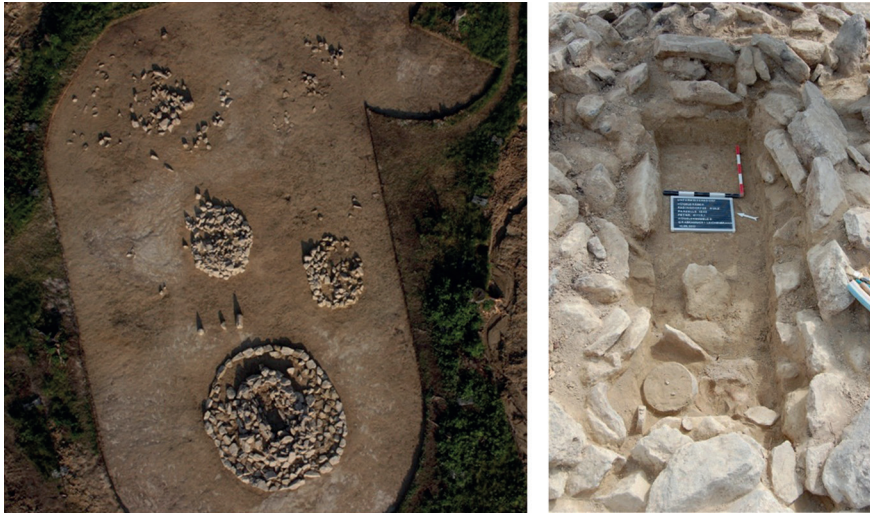
Burial mounds, urn graves and scattered burials at the site Unterweikersdorf (Upper Austria). Middle to Late Bronze Age transition, Bz D, c. 1300 BCE