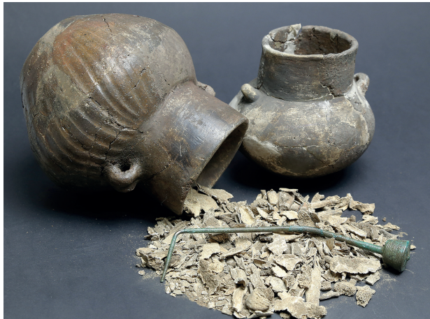
Pudliszki. Examples of bronze artifact and pottery discovered in collective cremation graves

This research was conducted as part of a project funded by the National Science Centre, Poland (grant no. 2022/47/D/HS3/00158).