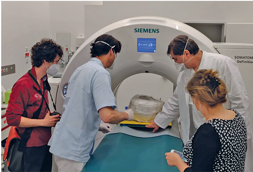
A Middle to Late Bronze Age urn from St. Pölten, Lower Austria, in the CT scanner