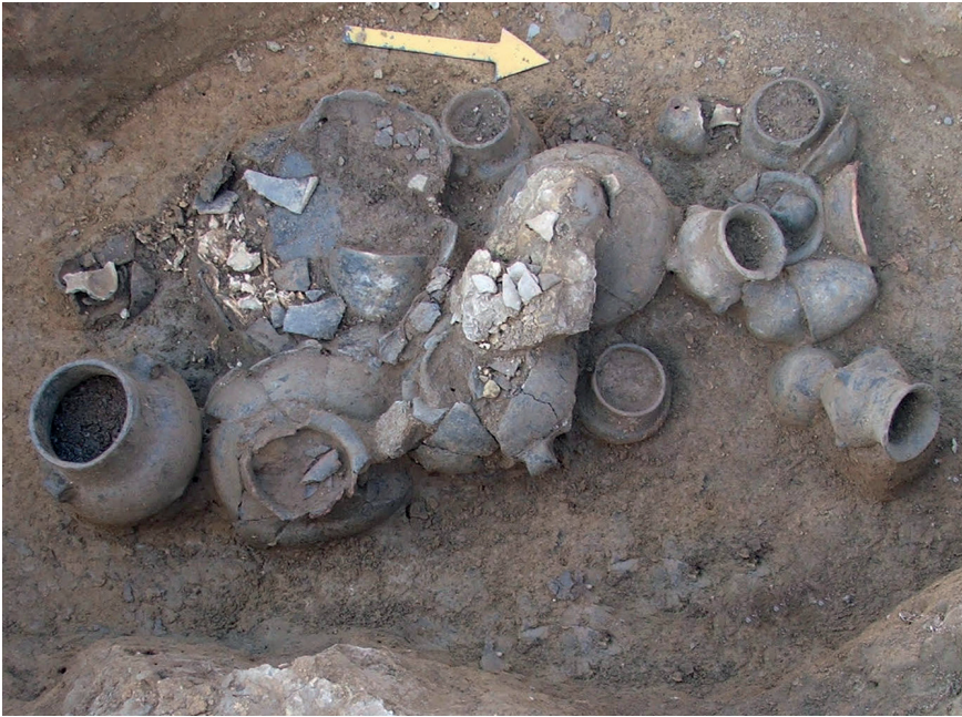
Multiple burial of the tumulus culture in Zagypálfalva