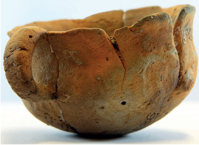
Pyre good from Grave 223/252 in the Jobbágyi-Hosszú-dűlő cemetery, Hungary