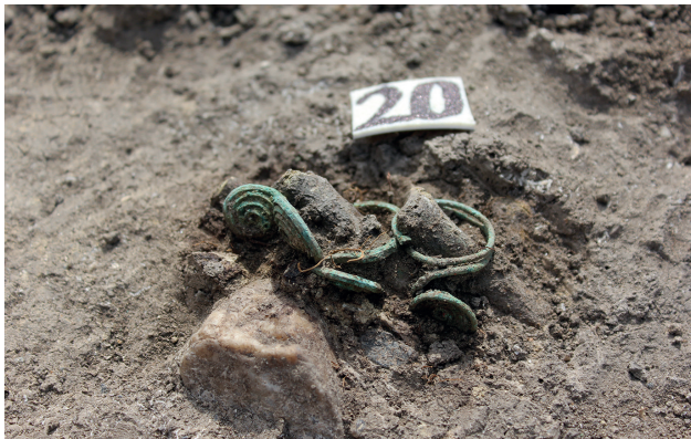
Bronze finger rings from the outstanding grave SNR 83 at Máty

The rich female burial discovered at this site may contribute to the identification of interregional connections and raises the question of the possible mobility and migration of socially significant women during the Bronze Age. Why does this burial stand out from the other graves in the cemetery? What similarities and differences can be observed among the rich burials of the various regions? These questions constitute the central focus of the present paper.